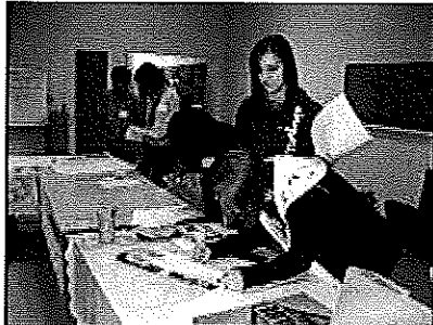
Esparto Middle School and High School students sign in at the RISE Office. An anti-tobacco youth group has expanded to Esparto.

In a continued effort to increase youth awareness about the dangers of tobacco use and the tobacco industry's youth marketing tactics, the Yolo County Anti-Tobacco Youth Coalition has expanded their youth coalition based in Woodland, to Esparto.